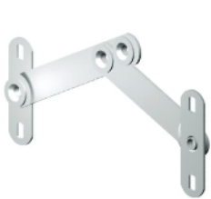
CONCEALED RESTRICTOR STAY

We source all our aluminium requirements from our parent company, McKechnie® Aluminium Solutions Limited who are one of the oldest and most experienced aluminium extruders in New Zealand.